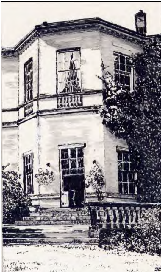
October 2005; Middleton Lodge