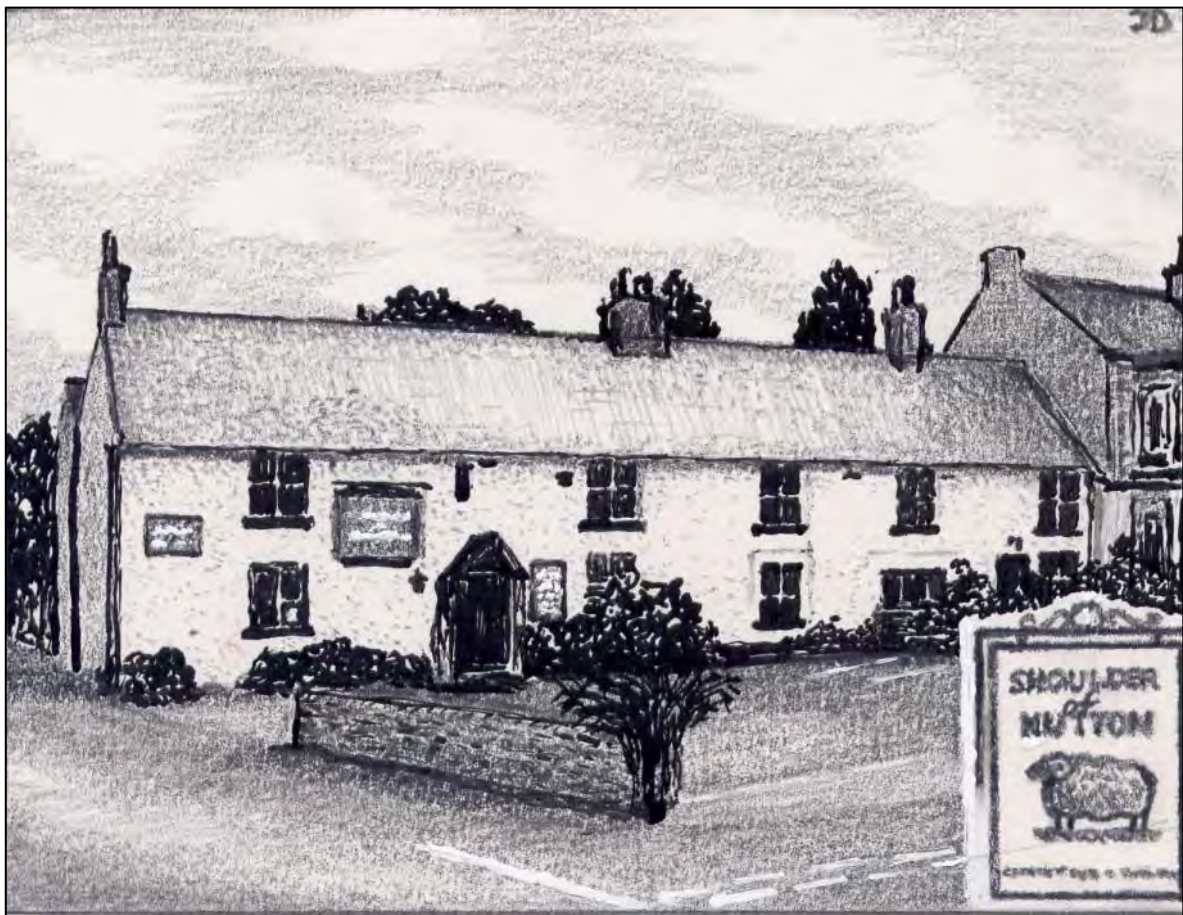
October 2011; Shoulder of Mutton Pub