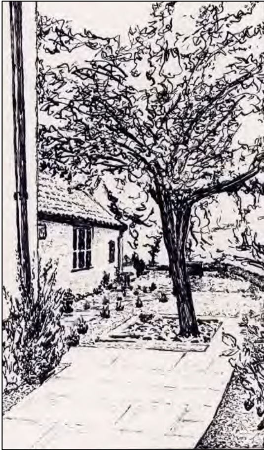
September 2004; WI Garden