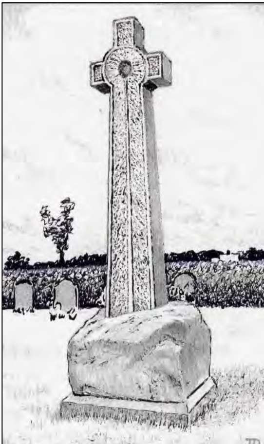
September 2007; Cross on ancient base in new graveyard