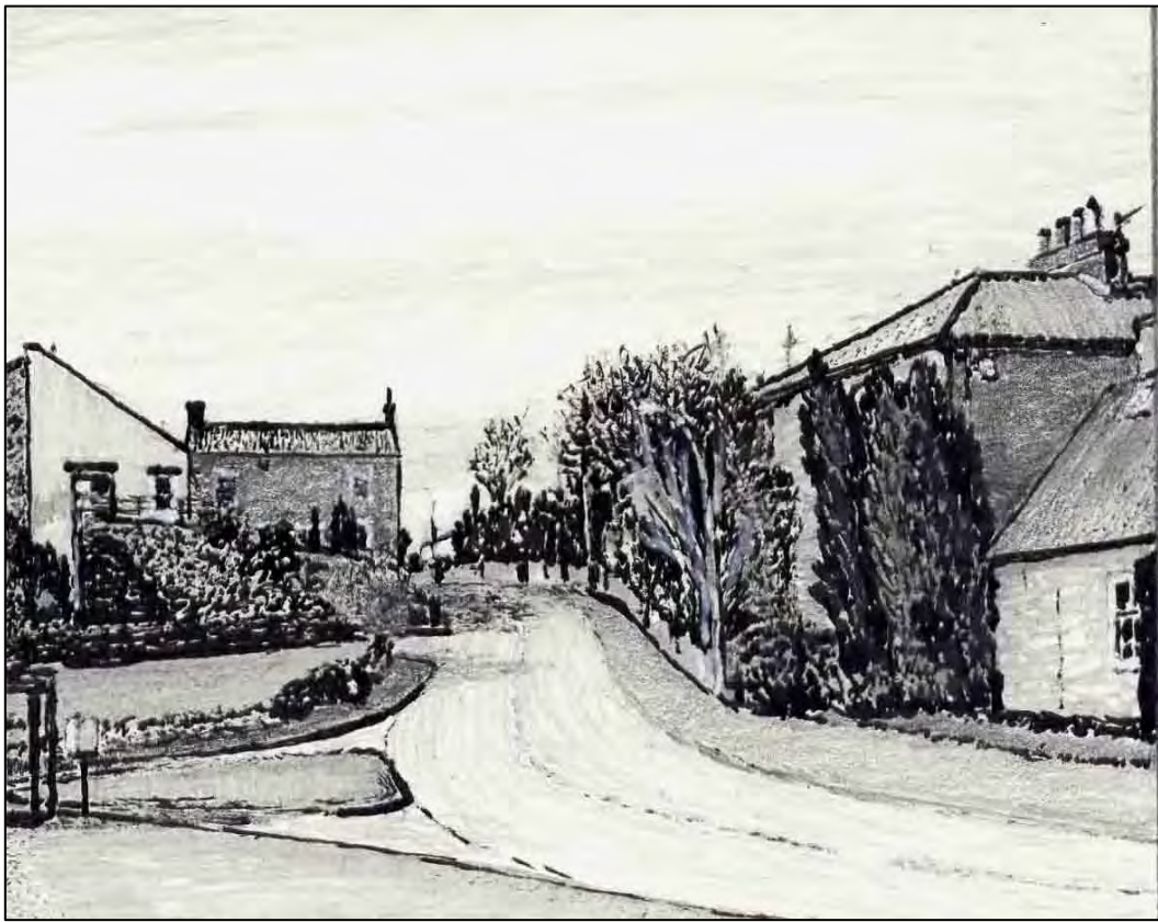
April 2004; Scurragh House Lane, Moulton