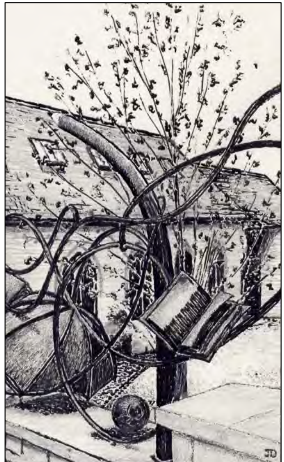
November 2007; Unnamed House - railings