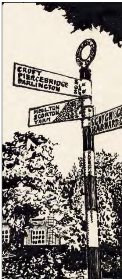
July 2002; Finger Post Village Green