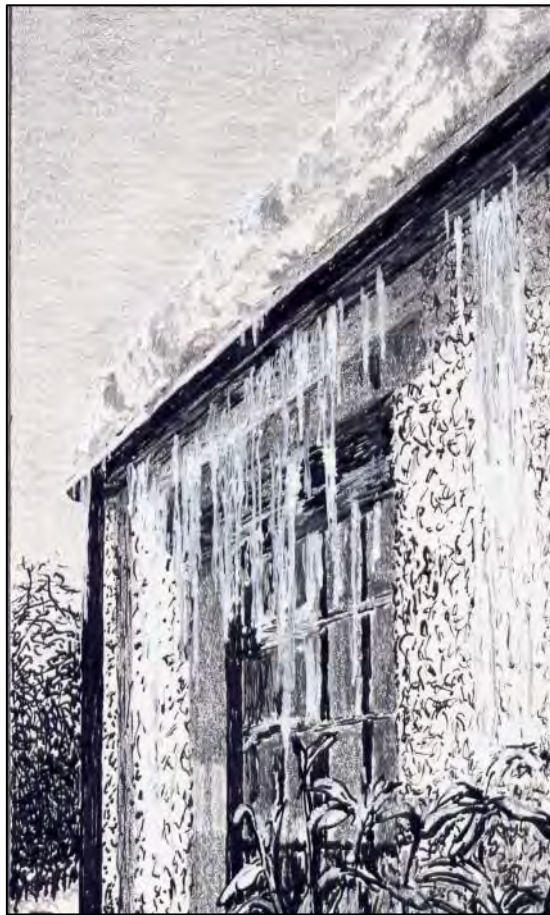
January 2011; Icicles, Hinkle Cottage