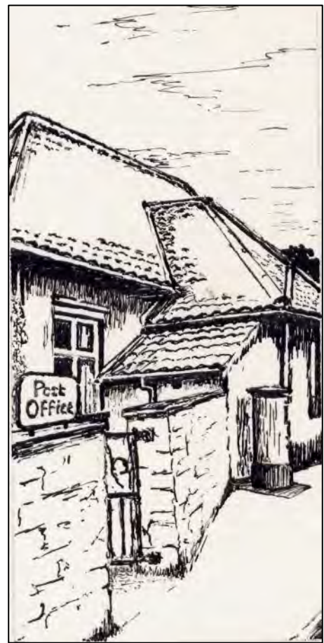
July 2003; Memorial Hall entrance