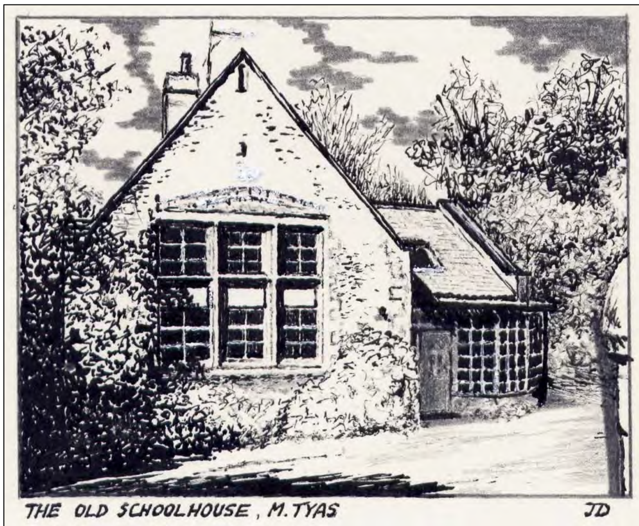
September 2009; Old School House