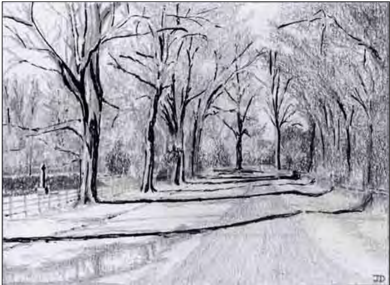
April 2012; The avenue from St. Michael and All Angels Church