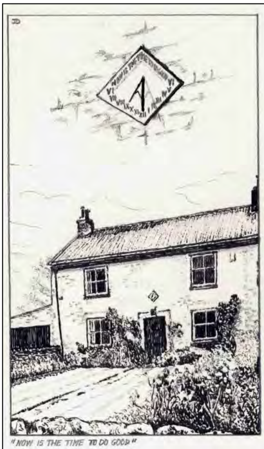
May 2007; Sundial Cottage