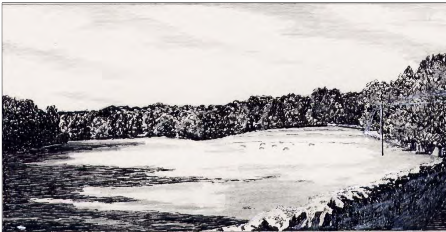
November 2006; Cow Park