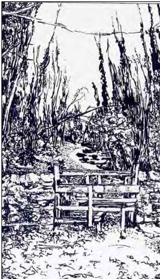
February 2004; Stile in Cow Park