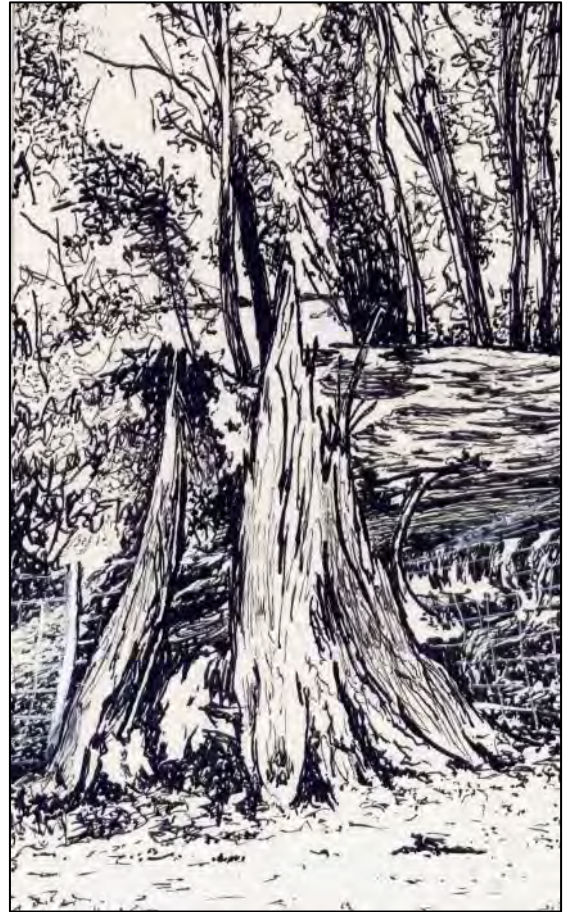
March 2005; Storm damaged tree