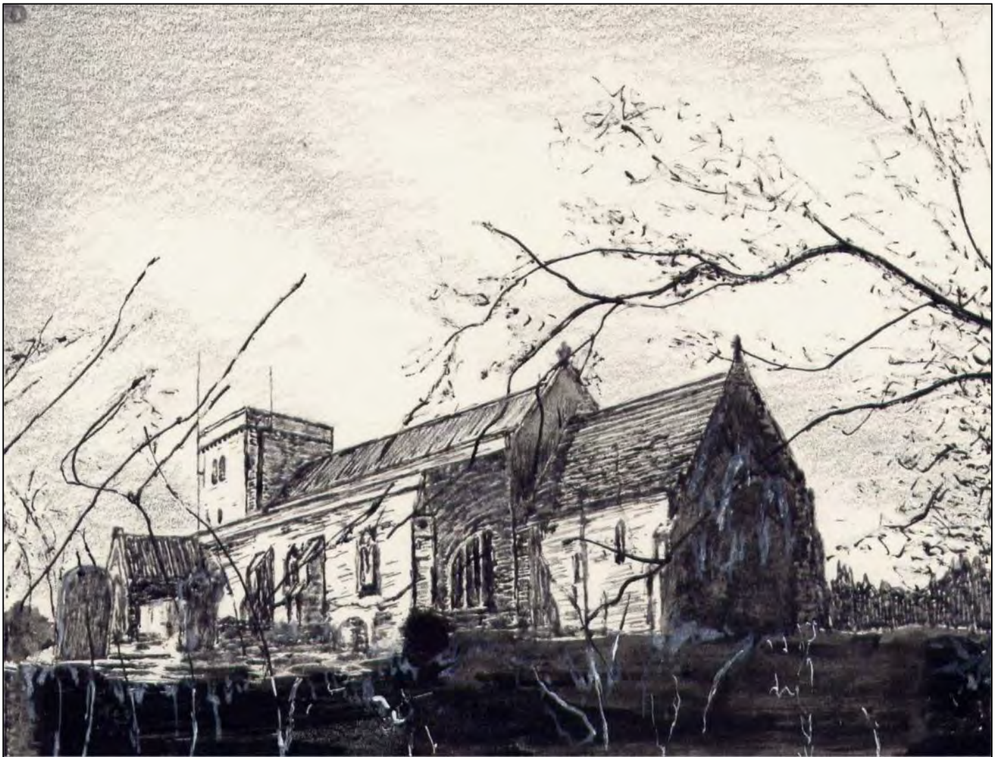
January 2008; St. Michaels and All Angels Church