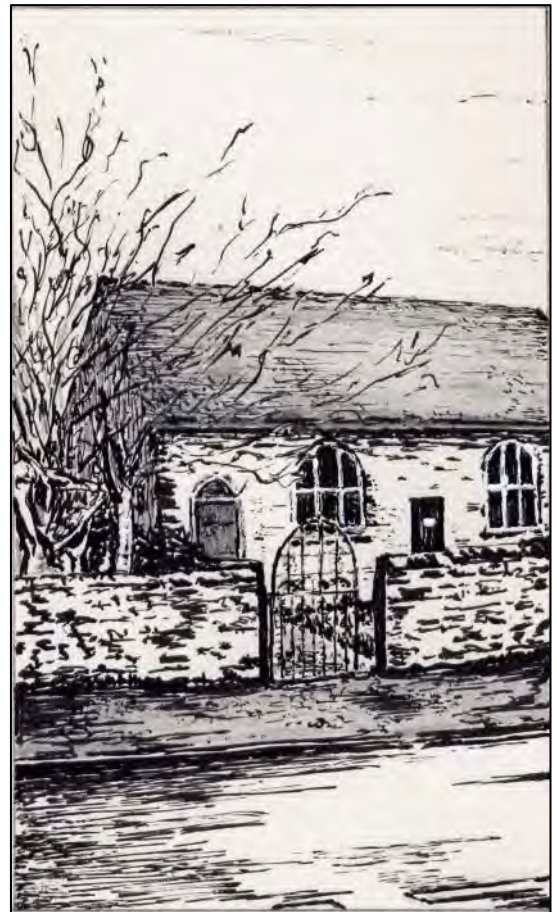
January 2006; St. Andrews Chapel, Moulton