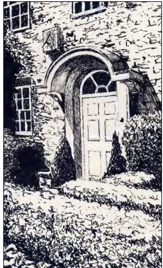
July 2004; West Hall