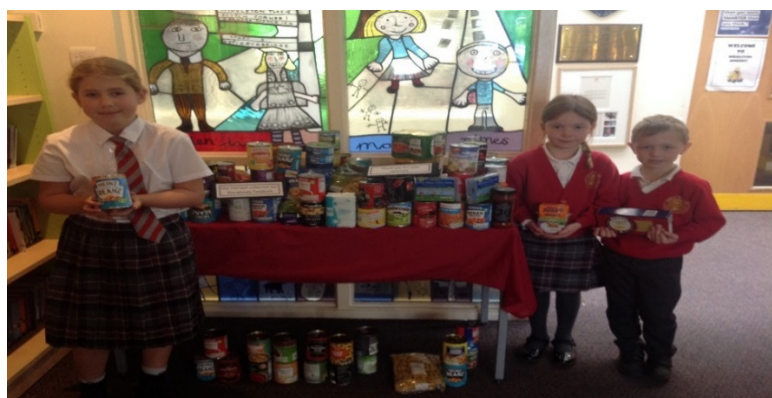
Pupils from Trinity Academy Middleton Tyas with the donations from their Harvest Festival which are being donated to the Storehouse Food Bank in Richmond

"Giving food to someone else means they can have a hot dinner like I do."