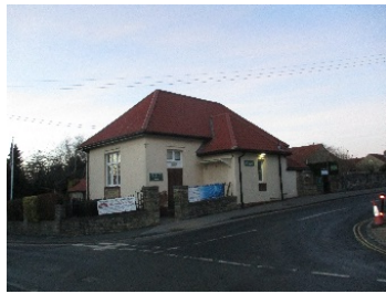
Middleton Tyas Memorial Hall Centenary of the end of WW1

Middleton Tyas Memorial Hall Committee would like to invite you to join with us in commemorating the centenary of the end of the First World War and remembering those brave soldiers from the village who gave their lives for their country and for whom the hall was built. A Memorial service will be held at the Hall on Sunday 11 th November at 11.00am, where a wreath will be laid below the stone of remembrance, followed by a 2 minute silence.