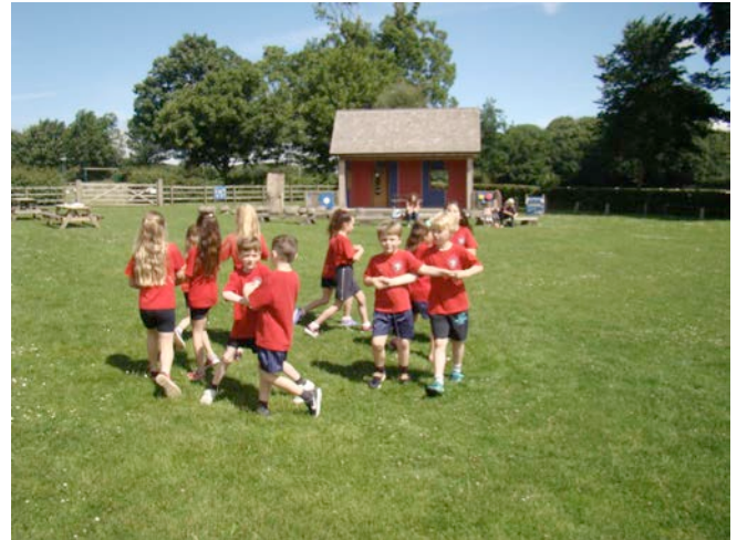
Country dancing at the School Summer Fair