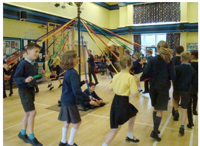
Maypole Dancing Third time lucky – in the school hall in July!