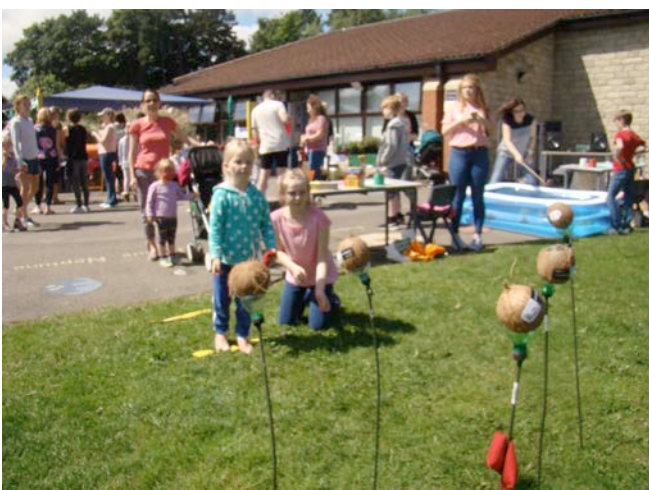
Coconut Shy at the School Summer Fair