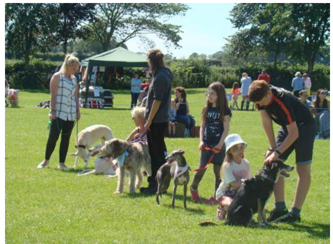
Bark in the Park Raised £1200 for the children's play area