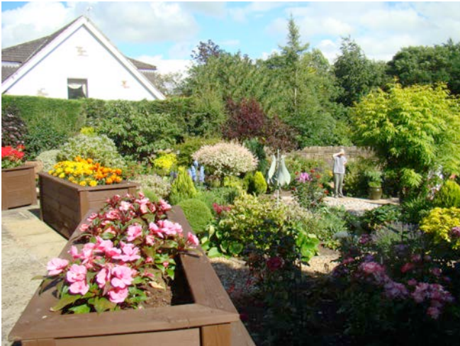
Open Gardens in June Raised £860 for the church