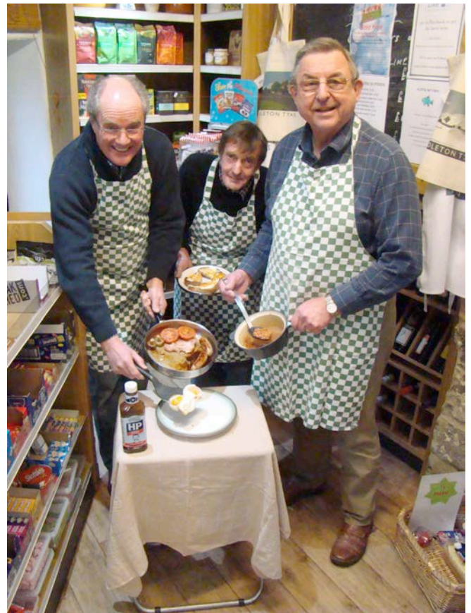
Some of the chefs getting in some practice ahead of the big event

Come and celebrate at the latest Big Man's Breakfast on Saturday 11 February, 9.30 – 1.00. Regulars will know that this is the best traditional Yorkshire Breakfast for miles around, when the people who usually do the cooking in most households can sit back and be cooked for by the flower of Yorkshire manhood!